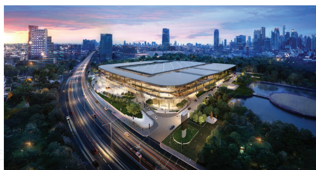
Halls 5 & 6

Queen Sirikit National Convention Centre (QSNCC)